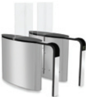
SmartLane 901 with Enhanced Entrance Control Footprint*: 1600 x 1200 mm (63" x 47")