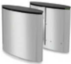
SmartLane 900 with Compact Footprint Footprint*: 1200 x 1200 mm (47" x 47")