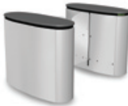
SmartLane 910 Footprint*: 1200 x 1800 mm (47" x 70 7 / 8 " )