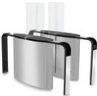
SmartLane 902 with Enhanced Entrance/Exit Control Footprint*: 2000 x 1200 mm (78 3 / 4 " x 47")