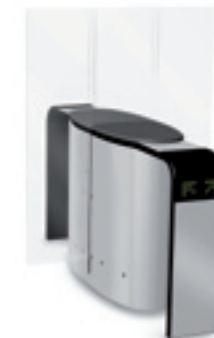
SmartLane 912 Twin with Enhanced Entrance/Exit Control and Compact Footprint Footprint*: 2000 x 1450 mm (78 3 / 4 " x 57")