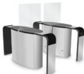
SmartLane 912 with Enhanced Entrance/Exit Control Footprint*: 2000 x 1800 mm (78 3 / 4 " x 70 7 / 8 " )