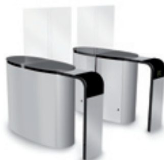
SmartLane 911 with Enhanced Entrance Control Footprint*: 1600 x 1800 mm (63" x 70 7 / 8 " )