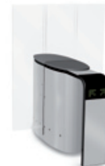
SmartLane 911 Twin with Enhanced Entrance Control and Compact Footprint Footprint*: 1600 x 1450 mm (63" x 57")