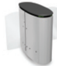
SmartLane 910 Twin with Compact Footprint Footprint*: 1200 x 1450 mm (47" x 57")